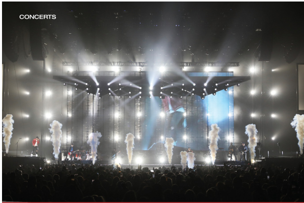
Twisting about the 12 crystals supplied by Direct FX, Ahlstrand says, "We have four around the B stage at the end of the thrust, one on each ergo ramp, and six to make a line across the front of the stage."

The set, fabricated by Gallagher Staging & Productions, is 60' wide. "We have some ergo ramps that go to the dasher with stairs," Ahlstrand says. "They're 8' tall x 12' wide. We will be hitting some amphitheatres and festivals, and a lot of those places have a lot of winds, but they feel cold, like concrete bowls. The ergo ramps are 5' rolling resin sections with 3' set extensions built on top; when we get into amphitheatres, we're going to take that 3' section and build it so it has the same feel as the arena show, out wider, past your 60' space. I think we've come up to something that is quite spread out but, at the same time, is totally doable almost every day."